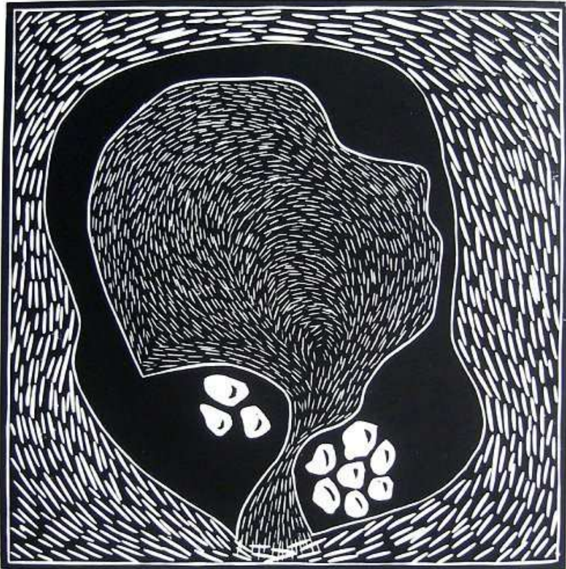
Figure 5:Field ("Lucky") Lino Cut, 30 x 30 cm

The third work, Field ("Lucky") is shown in Figure 5.