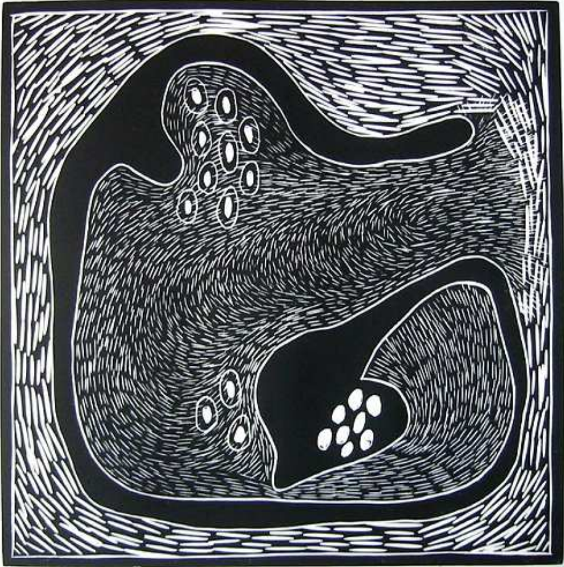
Figure 3:Field ("Black Snake"), Lino Cut, 30 x 30 cm

The foregoing discussion of the noumenal field is background to the art works I want to present. The first work, Field ("Black Snake") is shown in Figure 3.