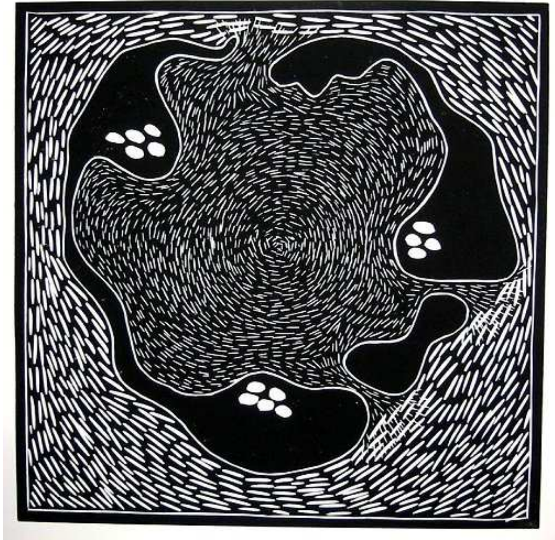
Figure 4: Field (“Atoll”), Lino Cut, 30 x 30 cm

The second work, Field (“Atoll”) , which I made more recently, is shown in Figure 4. In shape, this work is more consciously connected to the contact cycle diagrams – the thoughts above had already occurred to me prior to making the work.