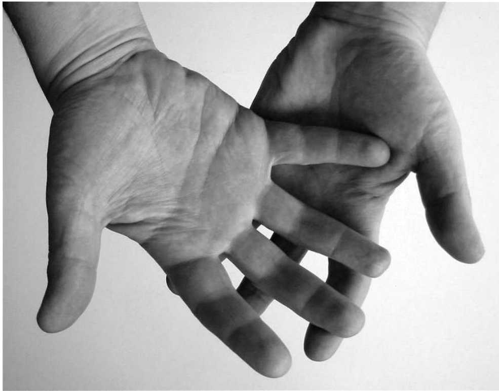
Figure 6: Mudra For a Momentary Intuition of the Field

communication that I did find quite “true”, soon after the event, was the use of a mudra that arose spontaneously. Figure 6 shows me making this mudra.